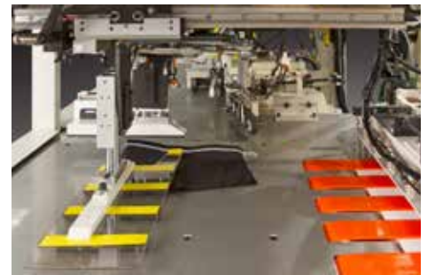
Fold-in-half station and closing stations