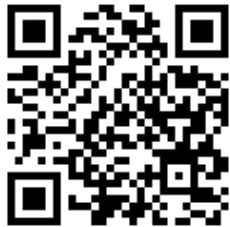
Scan QR Code ticket