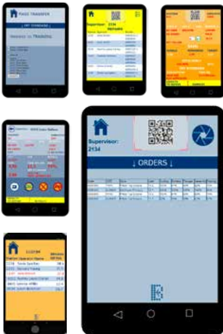
WIP Status on Supervisor App

A uniquely redefined Shop Floor Control and piecework payroll system based on inexpensive, off-the-shelf, Wi-Fi enabled Android Tablets is simple to learn, deploy and operate. Byte's software suite includes a bundle tracking system which has been reinvented from the ground up. It was co-developed with sewn products manufacturing customers and is now a shop floor system that satisfies the software requirements of large and small manufacturing companies AT AN AFFORDABLE COST.