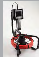
Pipe Inspection Kit