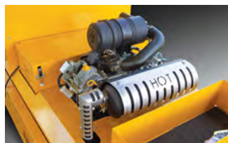
35 HP Vanguard Engine