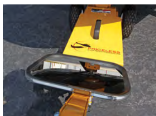
Robinson Ball Hitch shown in mirror from perspective of user