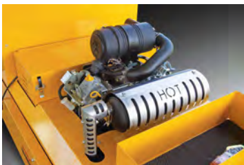
35 HP Vanguard Engine