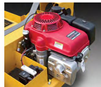
340cc Honda Engine

* Tug performance data based on level, smooth, paved surfaces.