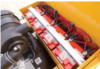
Jump Start Battery Bank