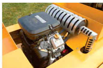
23 HP Vanguard Engine