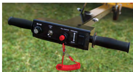
Controls and kill switch