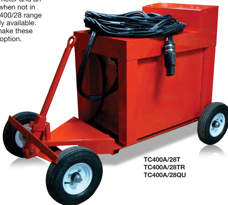
TC400A/28T TC400A/28TR TC400A/28QU