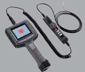
RBF700 with the 6.0 mm scope