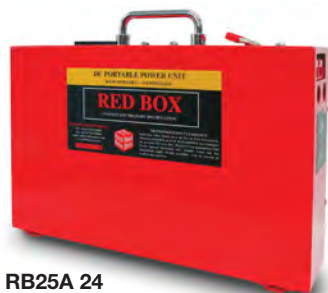
RB25A 24 RB25A 12

Typical: Robinson R22 & R44; Agusta Westland A109; Beechcraft Baron & Bonanza; Bell 206 Jet Ranger and 47; Cessna 180, 205 and 414 Cirrus SR20, Eurocopter AS355, Piper6X, Malibu Meridian and Malibu Mirage