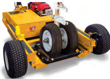
Single or dual nose wheel