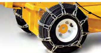
Optional Snow Chains