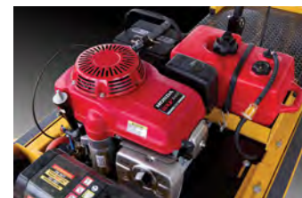
340cc Honda Engine

* Tug performance data based on level, smooth, paved surfaces.