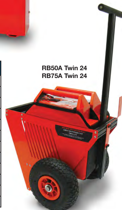
RB50A Twin 24 RB75A Twin 24

Warranty Red Box: 1 year against manufacturers defects