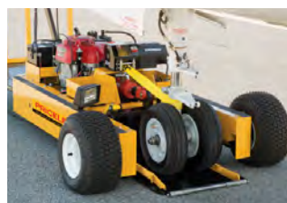
Pan Style Lift