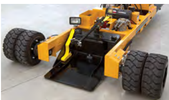
Dual Drive Wheels optional