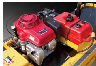
340cc Honda Engine

* Tug performance data based on level, smooth, paved surfaces.