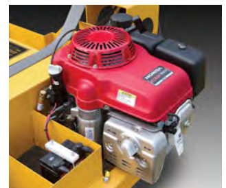
340cc Honda Engine

* Tug performance data based on level, smooth, paved surfaces.