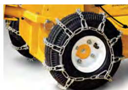
Optional snow chains

The model 701HB tug, developed with the same technology used for the fixed wing market, is for easier transportation of a Robinson helicopter in hangars and air fields. As the industry has come to expect, the engineers have added many user-friendly features not found on today's market. The model 701HBL is equipped with an extra-heavy-duty battery for longer life.