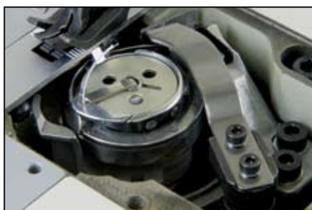
Automatic thread trimming device. Large bobbin capacity.