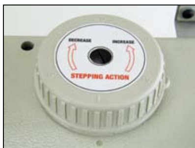
Top dial for convenient adjustment of walking feet for different material thicknesses.

It performs exceptionally well stitching natural and synthetic leather, nylon, canvas and medium-to-heavy fabric. Uses include car seats & interior decorations, furniture upholstery, tents, umbrellas, luggage, sports equipment and other heavy sewing demands.